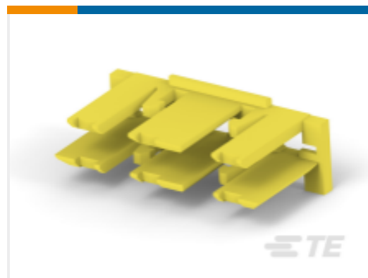
TE Part # 178024-7 FF 250 CAP HSG DBL 6P PLATE