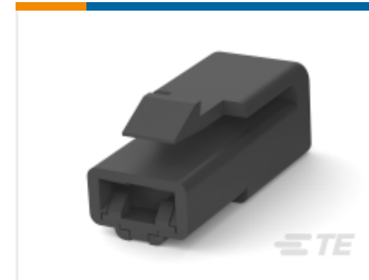
TE Part # 176986-2 FF 250 PLUG HSG 1P NYLON BLACK