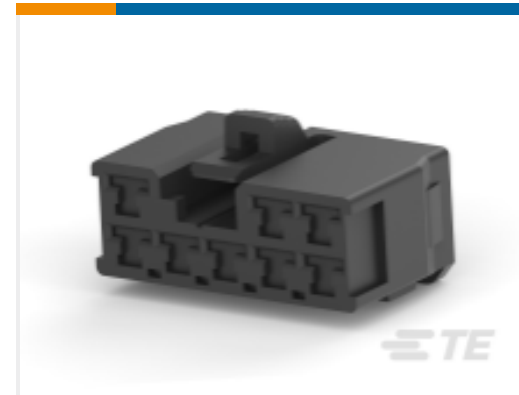
TE Part # 175979-2 FF 187 PLUG HSG 8P NYLON BLACK